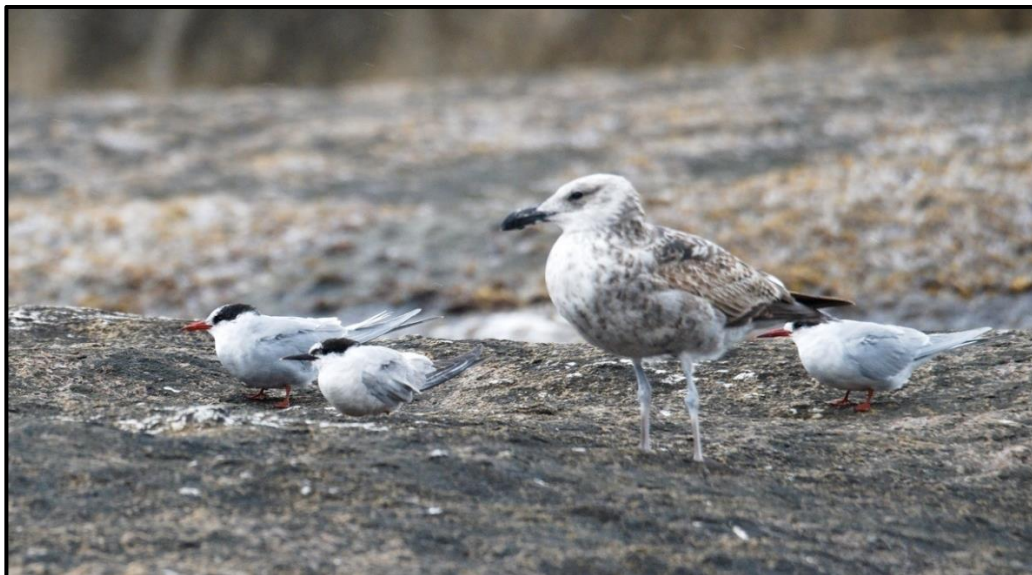
Antarctic Terns ( Sterna vittata ) at Maiden's Cove between Camps Bay and Clifton

Next, we headed over Constantia Nek to the west coast and popped into Hout Bay to see some Cape Fur Seals just when the wind began to rage! We hastily hopped back into the vehicle and drove the gorgeous coastline back towards the city. A brief stop at Maiden's Cove in almost gale force winds afforded us decent views of another target, Antarctic Tern , which was in the close company of Common Terns , Kelp Gulls and a Greater Crested Tern . We then called it a day in near impossible conditions, but fortunately during our return to the hotel we finally picked up Common Buzzard , with good views.