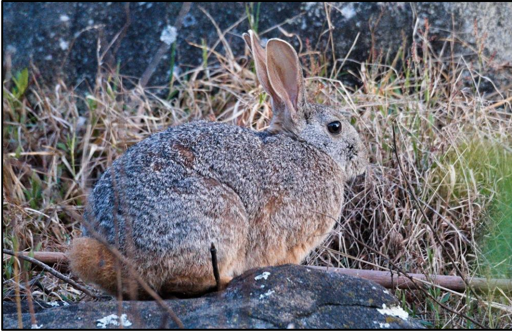
The seldom-seen Hewitt's Red Rock Hare ( Pronolagus saundersiae ) outside our chalet

Our drive through the reserve presented numerous great endemics and other treats, including Buff-streaked Chat , Eastern Long-billed Lark , Sentinel Rock Thrush and Cape Longclaw , as well as Capped and Mountain Wheatears , Wing-snapping Cisticola , Cape Crows , 2 overhead Cape Vultures and a Rock Kestrel , amongst others. On the mammal side we found Grey Rhebok and herds of Blesbok bounding through the mountain grasslands.