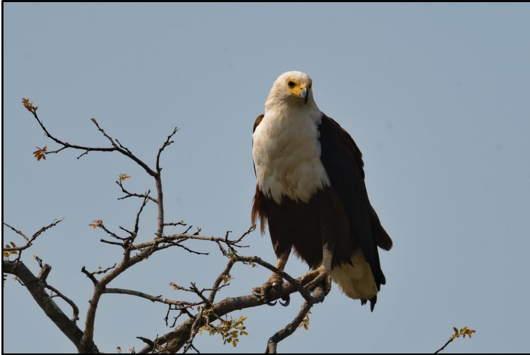
African Fish Eagle ( Haliaeetus vocifer ) scanning the activity around the dam

We left to find a substantial herd of African Buffalo , with many Yellow-billed Oxpeckers (encouraging to see) and several and Red-billed Oxpeckers grooming them, and a Black-crowned Tchagra calling nearby. As the day was warming up and things were slowing down we made our way back to camp for a rest, late brunch and a refreshing swim before the afternoon activities.