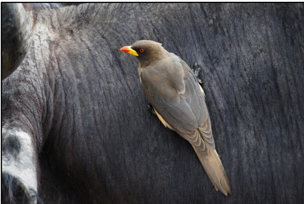
Yellow-billed Oxpecker ( Buphagus africanus ) hooking onto the hide of a Cape Buffalo ( Syncerus caffer caffer )

We left to find a substantial herd of African Buffalo , with many Yellow-billed Oxpeckers (encouraging to see) and several and Red-billed Oxpeckers grooming them, and a Black-crowned Tchagra calling nearby. As the day was warming up and things were slowing down we made our way back to camp for a rest, late brunch and a refreshing swim before the afternoon activities.