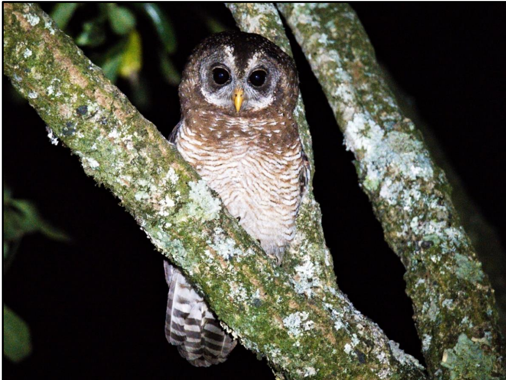
One of the pair of African Wood Owls ( Strix woodfordii ) that visited us outside the lodge