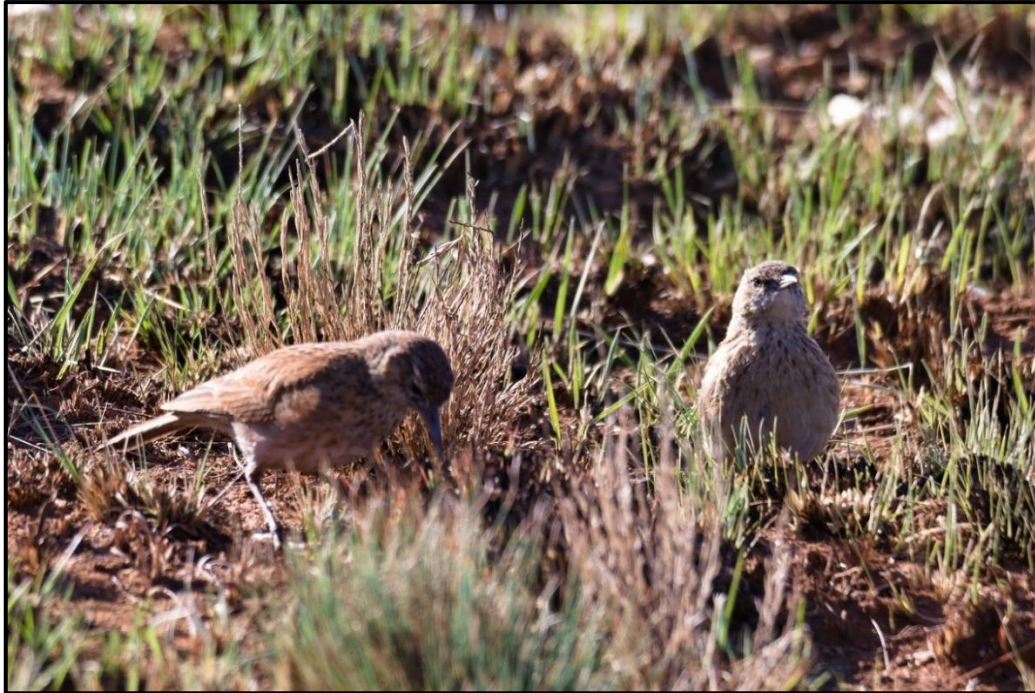
A pair of Eastern Long-billed Larks ( Certhilauda semitorquata ) feeding amongst the short recently burnt grass in Verloren Vallei

We then departed after breakfast for the glorious mountain and forest habitats of Mount Sheba. On our way we picked up a single Southern Bald Ibis and when we stopped for lunch in Lydenburg we added Brown-hooded Kingfisher , Southern Black Flycatcher , White-browed Sparrow Weaver and Yellow-fronted Canaries in the garden.