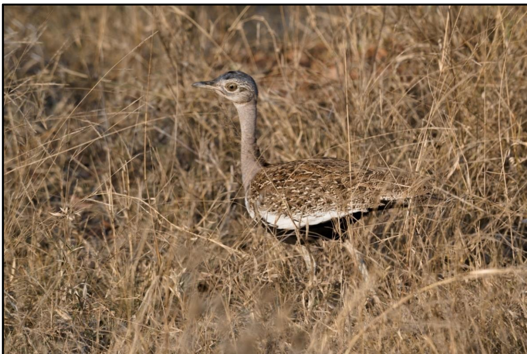
A lone male Red-crested Korhaan ( Lophotis ruficrista ) in the afternoon glow

Our afternoon drive found us heading southwards in the hope finding a few new birds and possibly some African Wild Dogs and White Rhinos . We first visited Transport Dam, where we picked up African Pied Wagtail and Water Thickknee , before winding our way along the Biyamithi River all the way to Biyamithi Weir. Along the way we found a lovely Red-crested Korhaan roadside, and shortly thereafter an adorable Dwarf Mongoose family on the gravel road. Despite some determined searching, we were unable to add anything else new, but did encounter a very large Cape Buffalo herd in the road, as well as a Spotted Hyena . We cruised back into camp to a lovely sunset.