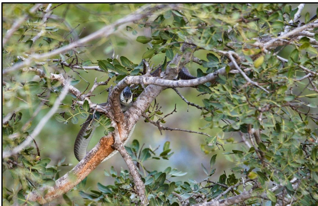
Female Boomslang ( Dispholidus typus ) that was being mobbed by a Black-backed Puffback at N'wanetsi Picnic Site

It was starting to get late and we needed to head back for camp, so we departed and soon found a gorgeous Malachite Kingfisher on the edge of the Sonop stream, with a magnificent bull Giraffe feeding in the stream, which made for a great scene. A bit further on we saw some vultures descending and soon found a gang of White-backed Vultures , 2 Lappet-faced Vultures and a welcome White-headed Vulture atop some trees and peering at an animal carcass that was just out of sight. The fact that they were not descending to ground, left us wondering what predators were still in attendance, holding them at bay. Further down the gravel track, while returning along the N'wanetsi River road, we came upon another large Elephant herd coming down to drink, and then shortly after, we chanced upon a large Lioness striding for the river with 4 Spotted Hyenas harassing her from behind. With her being alone and large-bellied, we were left wondering if she was going to seek a refuge near the river to den and potentially give birth. The light had now all but faded, and so we got back to camp just in time and headed straight to a delectable restaurant dinner.