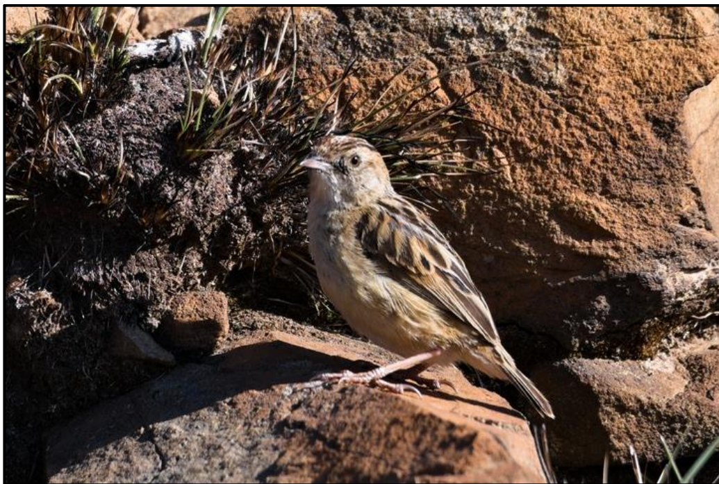
A confiding Wing-snapping Cisticola ( Cisticola ayresii ) searched the rocky bank alongside our vehicle

Our drive through the reserve presented numerous great endemics and other treats, including Buff-streaked Chat , Eastern Long-billed Lark , Sentinel Rock Thrush and Cape Longclaw , as well as Capped and Mountain Wheatears , Wing-snapping Cisticola , Cape Crows , 2 overhead Cape Vultures and a Rock Kestrel , amongst others. On the mammal side we found Grey Rhebok and herds of Blesbok bounding through the mountain grasslands.