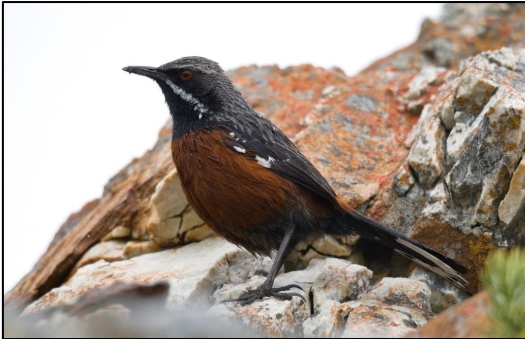
This male Cape Rockjumper ( Chaetops frenatus ) and his 3 family members put on a great performance for us in Rooi-Els