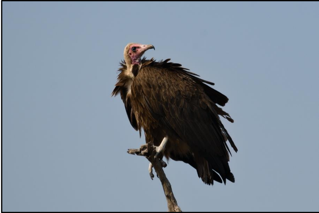
Hooded Vulture ( Necrosyrtes monachus ) in the morning sun, waiting for thermals to develop