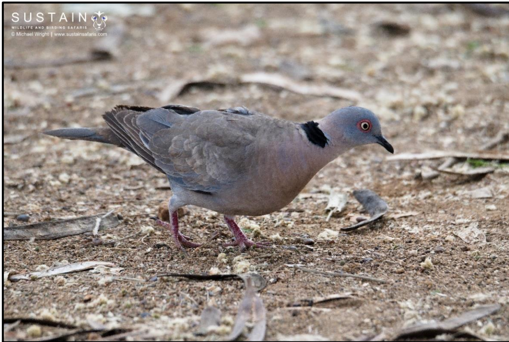
African Mourning Dove ( Streptopelia decipiens ) searching the leaf litter at Tshokwane Picnic Site

With the day having warmed up, we made steady progress and found a gorgeous male Common Ostrich very near the road, displaying its pink skin forelegs. We came across a few Elephant herds on the way, and near Kumana Dam we found some more Saddle-billed Storks , a Little Bee-eater and a Giraffe , several male Greater Kudus , a male Nyala and a Chacma Baboon troop all feeding on Sausage Tree pods and flowers. We carried on southwards and paused for a break at Tshokwane Picnic Site, and found a Spotted Hyena lurking about nearby, and a large family of Banded Mongooses scampering about. In addition, an African Mourning Dove was feeding near the restaurant.