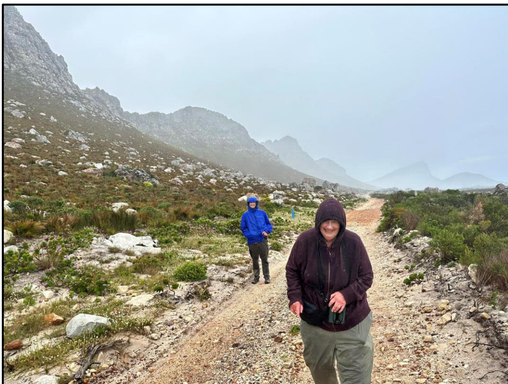
The steady drizzle and wind tested us in Rooi-Els, but we soldiered on to find our targets.

We next ventured to Stony Point, where we enjoyed the multitude of African Penguins and a very near African Oystercatcher , together with many Cape and Bank Cormorants , and several Rock Hyraxes . The rain returned and so we headed for a delectable seafood lunch. We attempted to locate a Victorin's Warbler , but with the now strong winds, this proved unsuccessful. So, we returned toward the Cape Peninsula, and