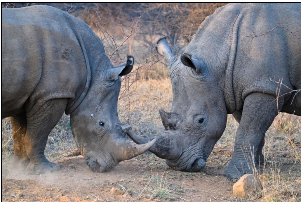
These female and male White Rhinos ( Ceratotherium simum ) were becoming very amorously as the sun began to set

That afternoon we got going again at 16h00, and decide to tour the reserve. We soon found a Chestnut-vented Warbler , and shortly thereafter, a family of 3 White Rhinos (father, mother and young adult calf) surprised us in the middle of the road and provided the most fantastic viewing experience in the golden light. The adult bull and cow definitely had some romance going up, and were behaving very amorously with one another, signalling that they would soon likely mate. A bit further on we found a Black-backed Jackal running through the open woodland, which became the first of quite a few. The light was fading fast, so we headed back to camp to arrive just in time.