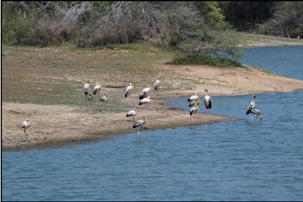
14 Yellow-billed Storks ( Mycteria ibis ) grouped together is not a common scene

Our afternoon drive found us heading southwards in the hope finding a few new birds and possibly some African Wild Dogs and White Rhinos . We first visited Transport Dam, where we picked up African Pied Wagtail and Water Thickknee , before winding our way along the Biyamithi River all the way to Biyamithi Weir. Along the way we found a lovely Red-crested Korhaan roadside, and shortly thereafter an adorable Dwarf Mongoose family on the gravel road. Despite some determined searching, we were unable to add anything else new, but did encounter a very large Cape Buffalo herd in the road, as well as a Spotted Hyena . We cruised back into camp to a lovely sunset.