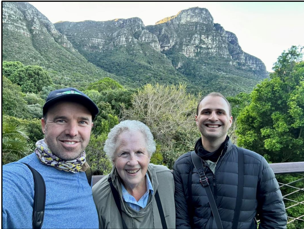
A memorable touring team photo in Kirstenbosch to celebrate our arrival in Cape Town – still smiling broadly near the end of the tour.