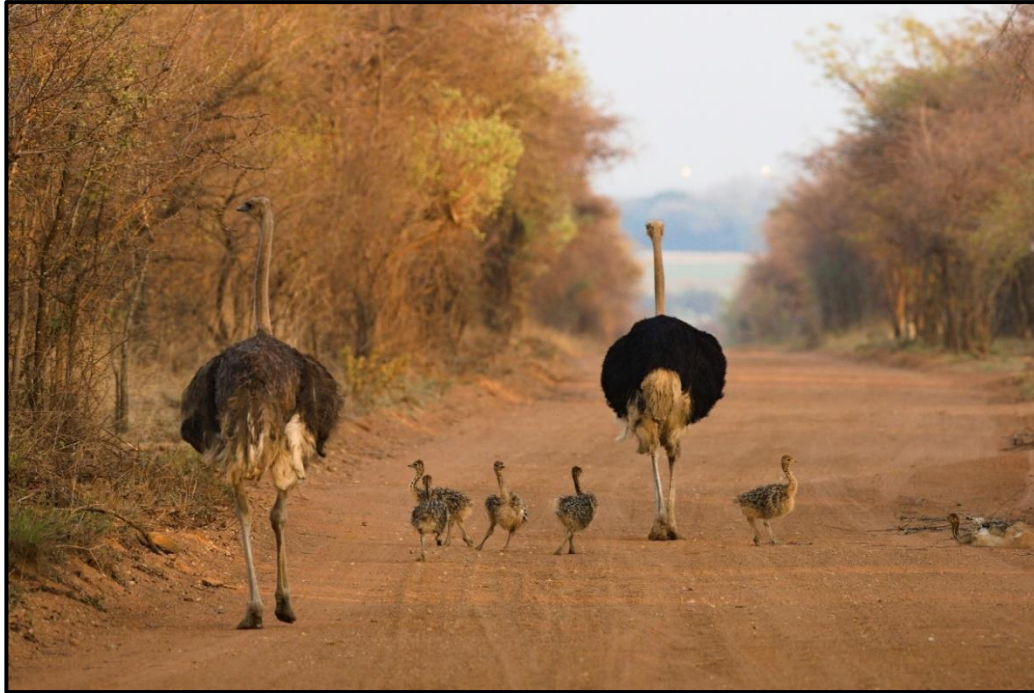
Common Ostrich ( Struthio camelus ) family on their morning walk and dust bath

We then headed for the Zaagkuilsdrift road, and the temperature was rising fast. Despite this, we located a flock of Scaly-feathered Weavers , a Crimson-breasted Shrike , Southern Pied Babblers , and several Black-faced Waxbills . When we reached the bridge across the mainstream, while pausing to check the banks, we caught sight of movement below us beneath some overhanging branches, and to our great delight a magnificent male African Finfoot appeared, no more than 15 metres from us – definitely the bird of the trip to that point! We watched it for a decent amount of time, but it sensed it was vulnerable and quickly went under the bridge and around the high reeded bend in the river to disappear from view. As the heat really set in, things slowed down and all we managed to add on the dry Kgomo-Kgomo floodplain was a Common Sandpiper aside the river. So, we returned to our lodge for some needed rest.