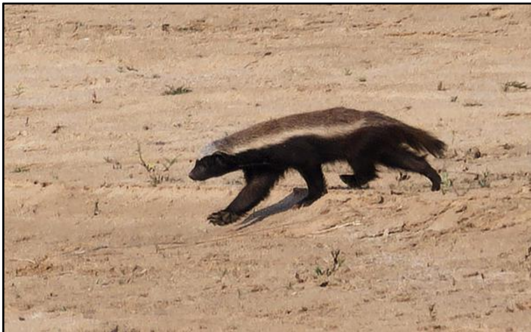
This Honey Badger ( Mellivora capensis ) strode onto the Sabie River bed and headed straight to the river for a drink

We then headed further south, and paused at a small dam to watch some entertaining Hippos , and an amazing flock of 14 Yellow-billed Storks was a big surprise. We continued westwards along the N'watimhiri Road and located a Klipspringer pair at Rhenosterkoppies, before returning to Skukuza for a late lunch and rest.