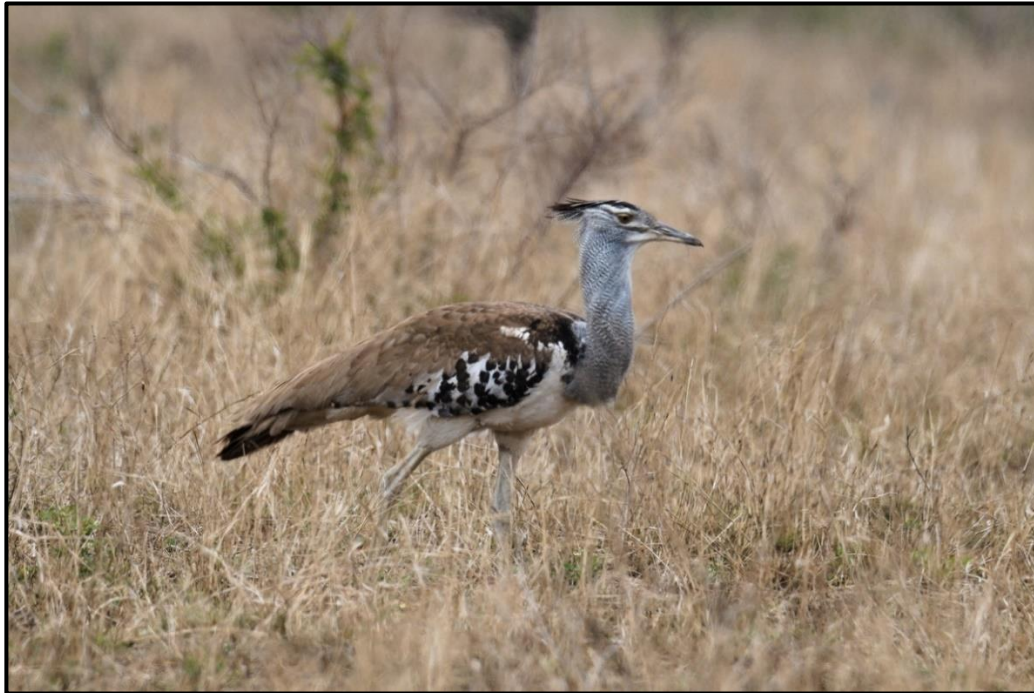
One of 2 Kori Bustards ( Ardeotis kori ) seen searching for prey within close proximity of each other

A bit further down the track, just before entering a dryer riverbed with a few pools, we discovered a gorgeous Saddle-billed Stork resting roadside. After many photos we proceeded onto the bridge and noticed a Bateleur descend onto the edge of a pond and proceed to catch a sizeable fish and make quick work of it. Within seconds of it being swallowed, 2 Hamerkops and a Tawny Eagle rushed in, and the Tawny attempted to pilfer the fish. We carried on and soon came upon 2 Kori Bustards striding through the open savannah within a few kilometres of each other. We then headed back to camp for another late breakfast, before packing and departing southwards for Skukuza.