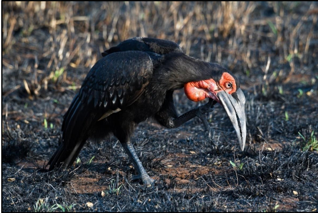
An adult Southern Ground Hornbill ( Bucorvus leadbeateri ) scratching an itch while foraging in recently burn grassland