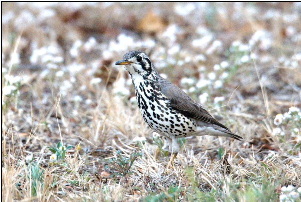
One of the Groundscraper Thrush ( Turdus litsitsirupa ) pair hopping about the lodge chalets

This morning we arose early once more and set off at first light, but paused to enjoy a pair of Groundscraper Thrushes before exiting the lodge property. We wound our way through the reserve to the northern gate and first encountered a lovely Common Ostrich family, comprising a dad, mom and 6 chicks. Next up were a Brubru and African Grey Hornbill . We then heard a Northern Black Korhaan and Barred Wren-Warbler , both calling just out of view. Shortly after exiting the reserve we added Violet-eared Waxbills feeding with Green-winged Pytilias and Blue Waxbills , a pair of Red-breasted Swallows , a Secretarybird , a perched Black-chested Snake-Eagle and Wahlberg's Eagle , another melanistic Gabar Goshawk , and a delightful Pearl-spotted Owlet .