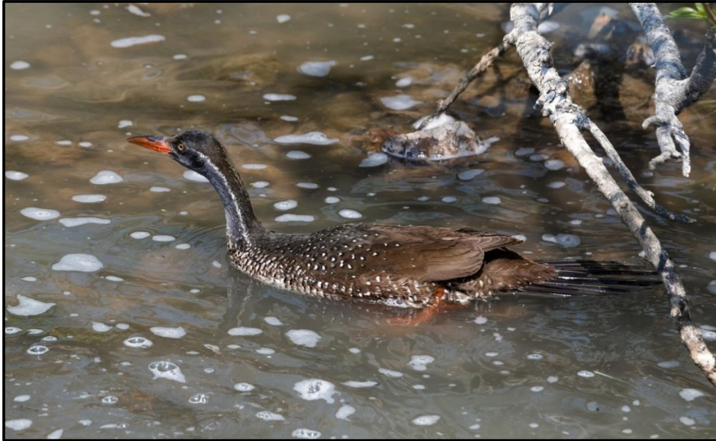
This spectacular male African Finfoot ( Podica senegalensis ) was directly beneath us at the Zaagkuilsdrift River bridge – the bird find of the tour!

That afternoon we got going again at 16h00, and decide to tour the reserve. We soon found a Chestnut-vented Warbler , and shortly thereafter, a family of 3 White Rhinos (father, mother and young adult calf) surprised us in the middle of the road and provided the most fantastic viewing experience in the golden light. The adult bull and cow definitely had some romance going up, and were behaving very amorously with one another, signalling that they would soon likely mate. A bit further on we found a Black-backed Jackal running through the open woodland, which became the first of quite a few. The light was fading fast, so we headed back to camp to arrive just in time.