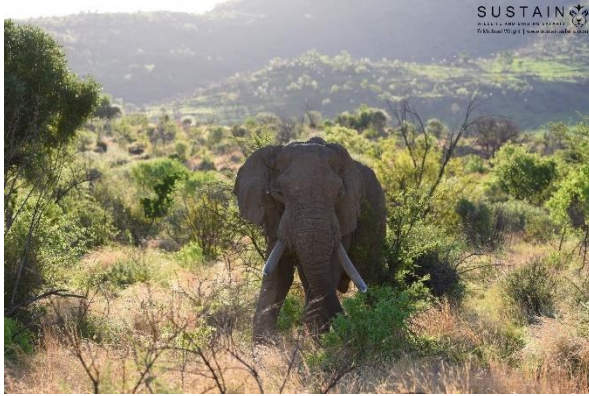
African Elephant ( Loxodonta africana )