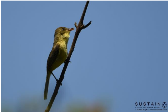
Dark-capped Yellow Warbler

Route: Around Woodbush Forest and Haenertsburg. Weather: Clear or partly cloudy most of the day. Temperature range: 14-33°C. Birds of the Day: Cape Parrot, Black-fronted Bush-Shrike, Barratt's Warbler, African Emerald Cuckoo. Mammals of the Day: Samango Monkey. Daily Bird Total: 99 seen and 3 heard. Daily Mammal Total: 2 seen and 1 heard.