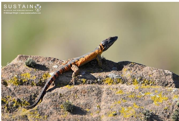
Drakensberg Crag Lizard ( Pseudocordylus melanotus )