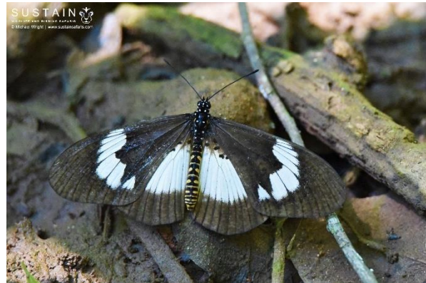
White-barred Acraea ( Hyalites encedon encedon )