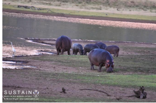
Hippopotamus ( Hippopotamus amphibius )