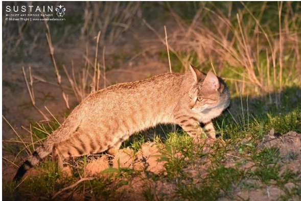
African Wild Cat