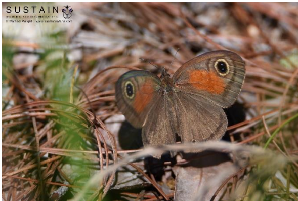
Rainforest Brown ( Cassionympha cassius )