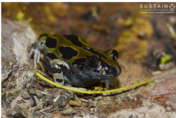
Bubbling Kassina ( Kassina senegalensis )