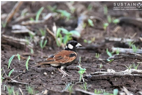
Chestnut-backed Sparrow-Lark male