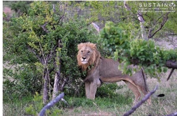
Male Lion – one of the coalition brothers