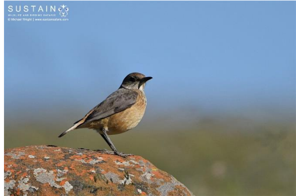
Sentinel Rock-Thrush female