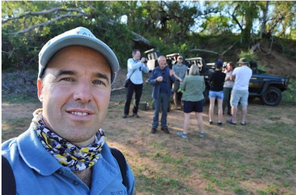
Morning coffee on the Olifants River floodplain