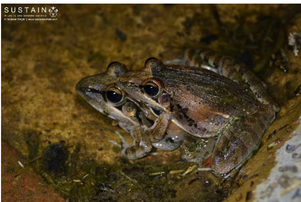
Sharp-nosed Grass Frog ( Ptychadena oxyrynchus )