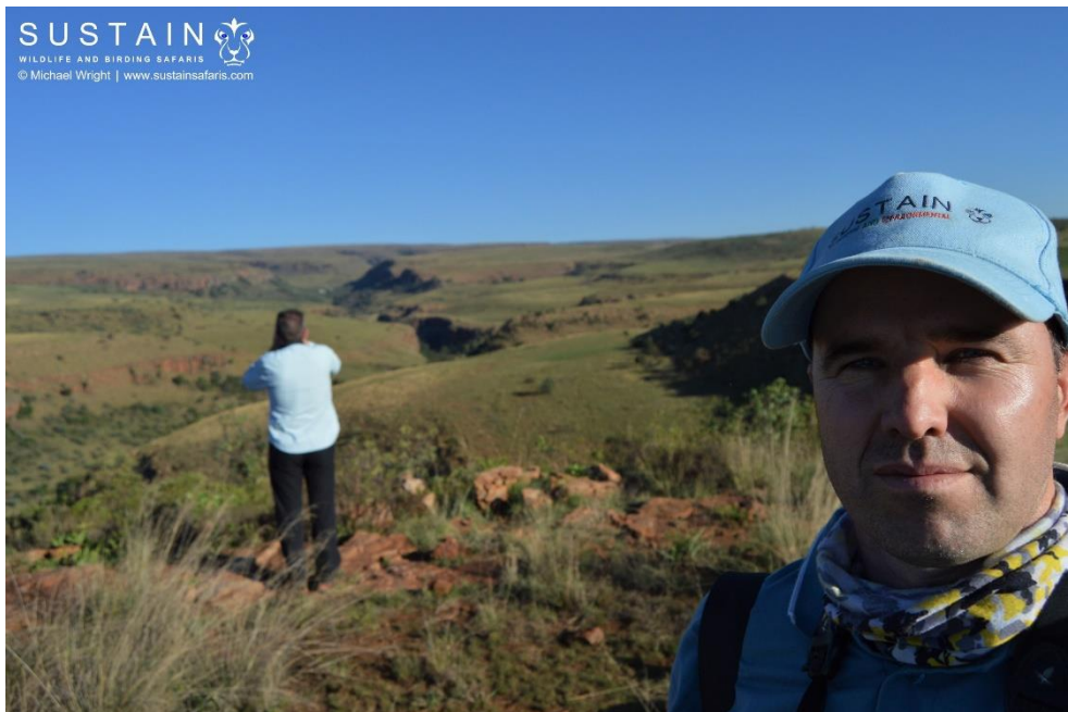
Mount Anderson vistas