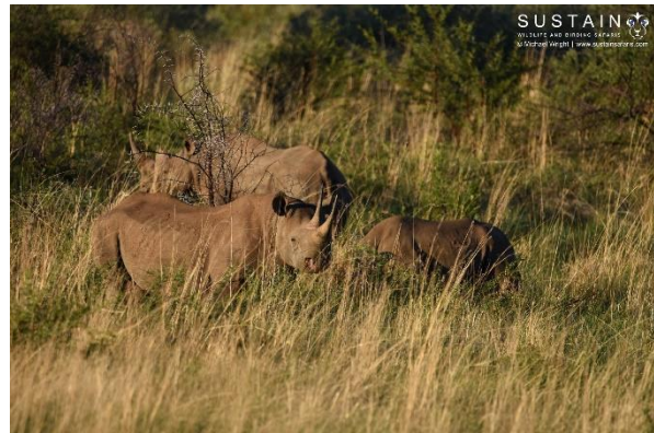
3 Black Rhinos